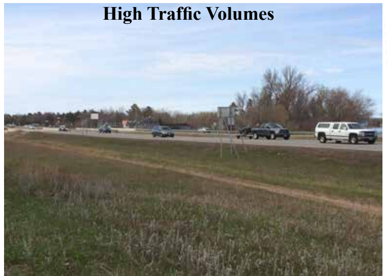
High Traffic Volumes