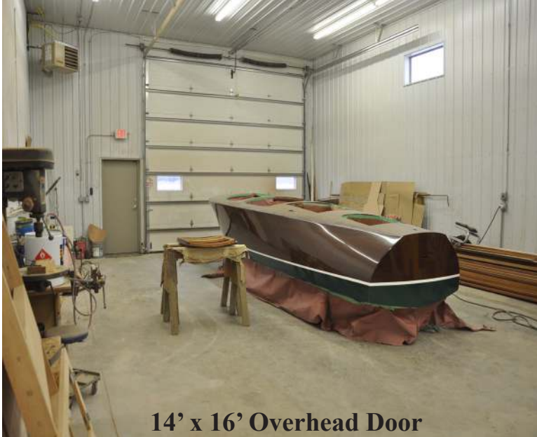
14' x 16' Overhead Door