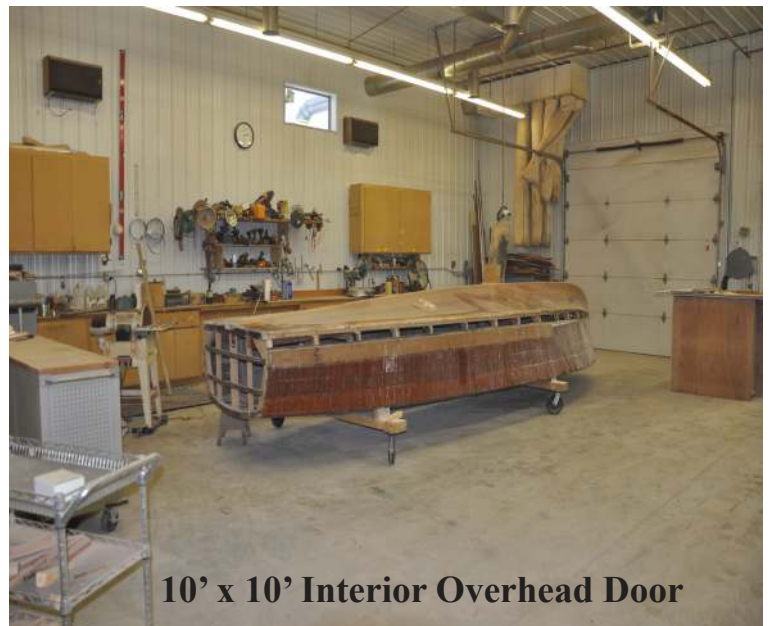
10' x 10' Interior Overhead Door