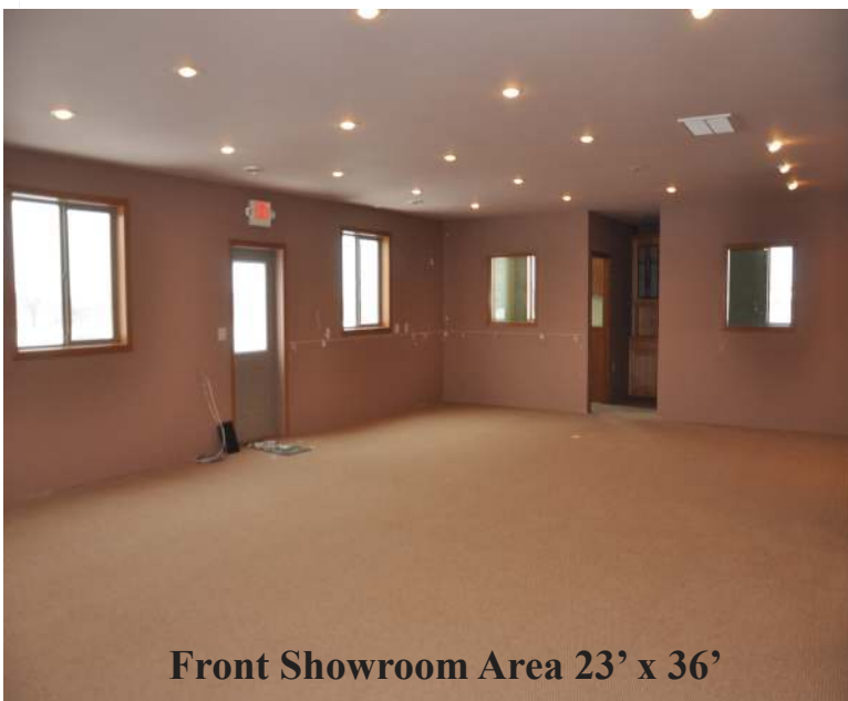
Front Showroom Area 23' x 36'