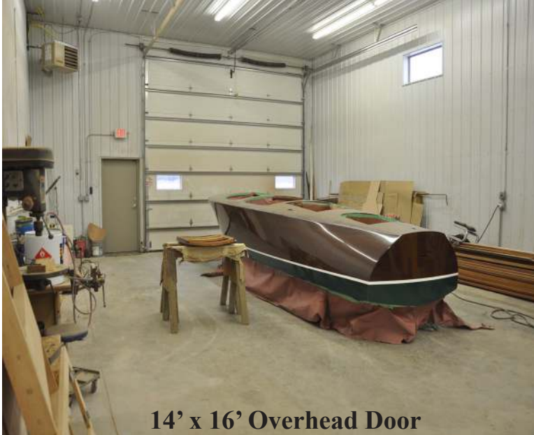
14' x 16' Overhead Door