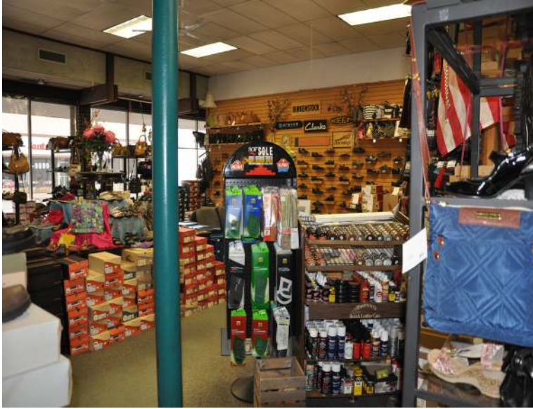
South Entrance Into the Building

3 Entrances make it easy to demise the building!