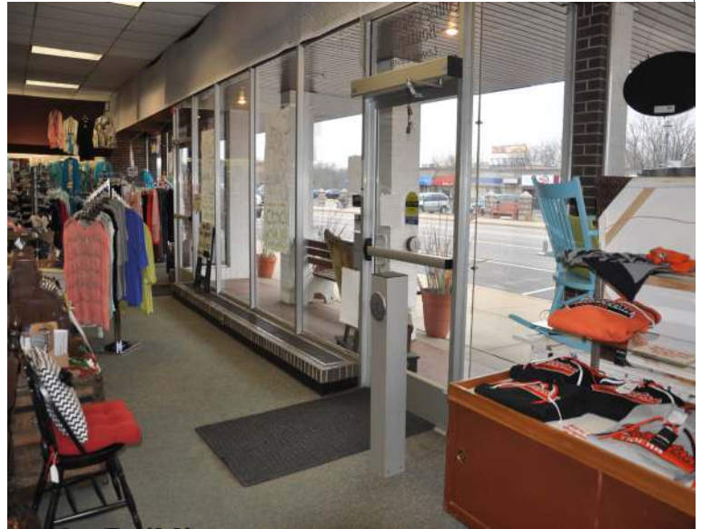
East Entrance Into the Building