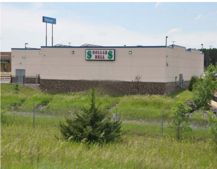
View from Highway 169