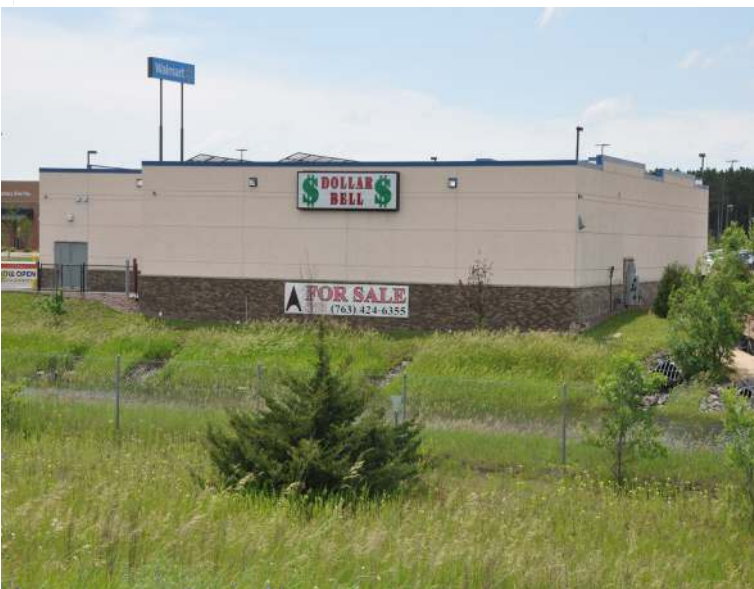
View from Highway 169