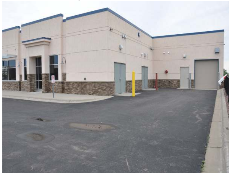
Rear & Side View