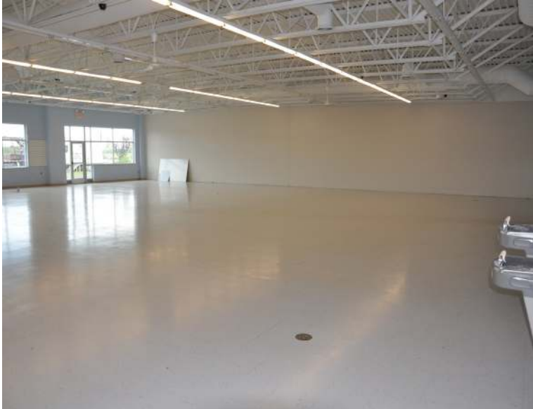
Suite 107-108 (Combined) - 6,717/sf

Space from 1,372/sf to 7,091/sf Available!