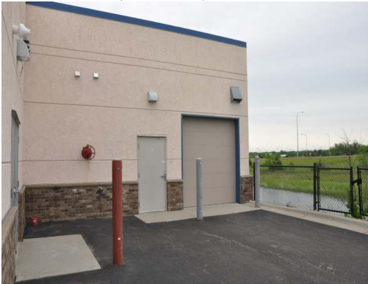
Rear of Storage Area