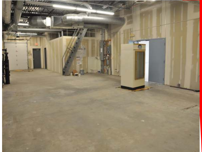
INCLUDES Storage Area