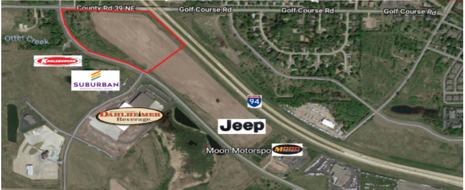
Great Interstate Frontage