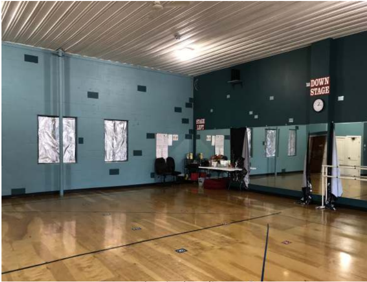
Downstairs Dance Studio (38'x39')