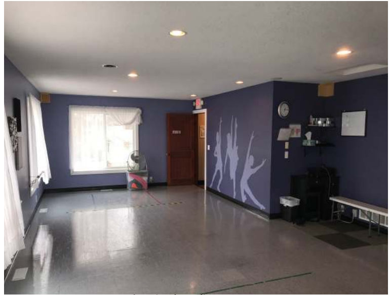
Upstairs Dance Studio (43'x19')