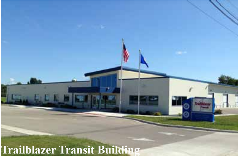
Trailblazer Transit Building