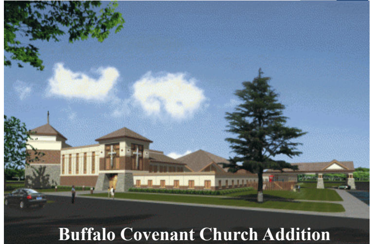
Buffalo Covenant Church Addition