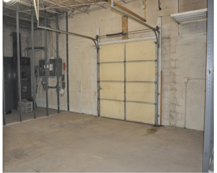
Suite C (518/SF) * Warehouse Space * 8' x 8' Overhead Door