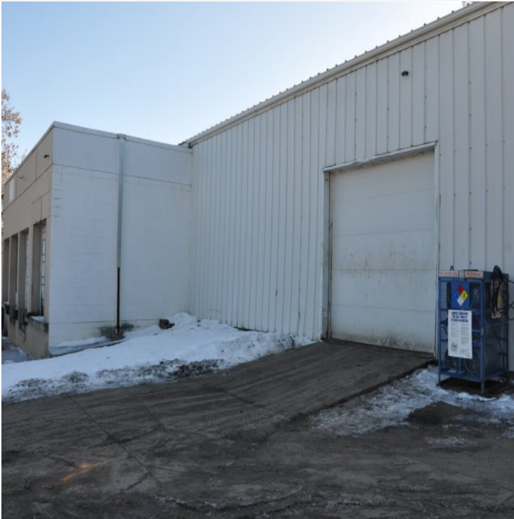
Suite 4: 7,730 SF *(2) Loading Docks * 10' x 10' Overhead Door

Contact: WAYNE ELAM (763) 229-4982 WElam@commrealtysolutions.com