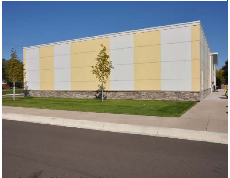
South Side of Building