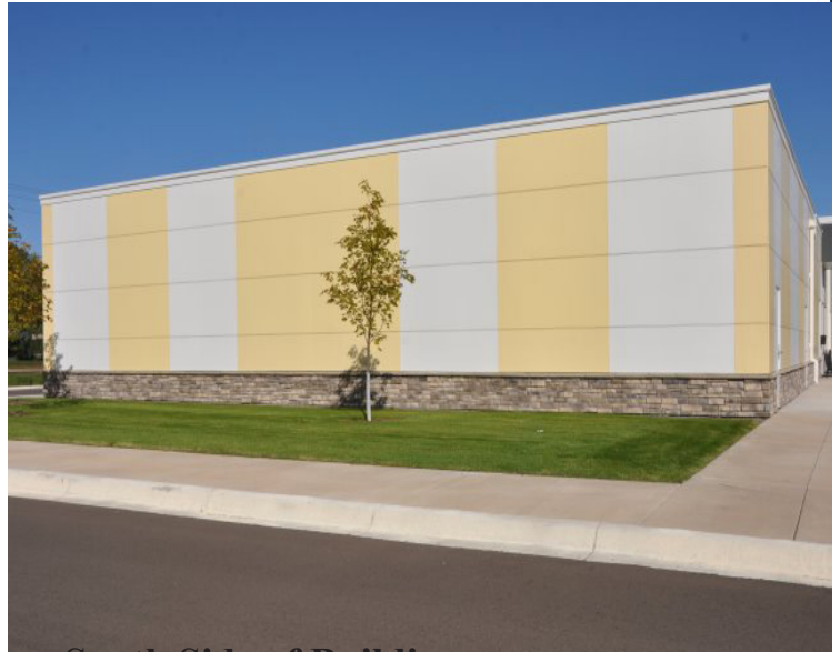
South Side of Building