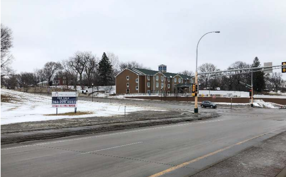
View of Lot