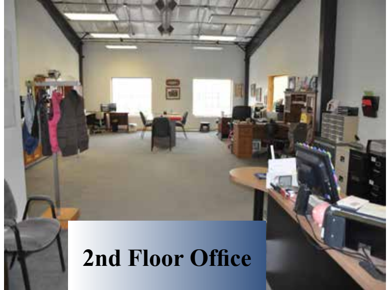
2nd Floor Office