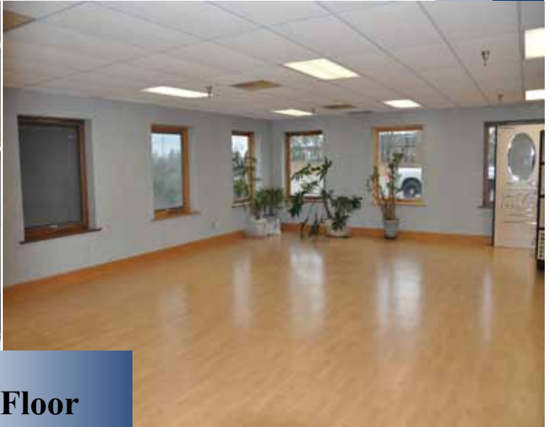
1st Floor Office Area!