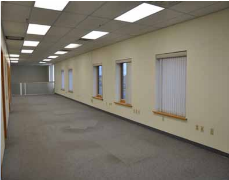
2nd Floor Office Area