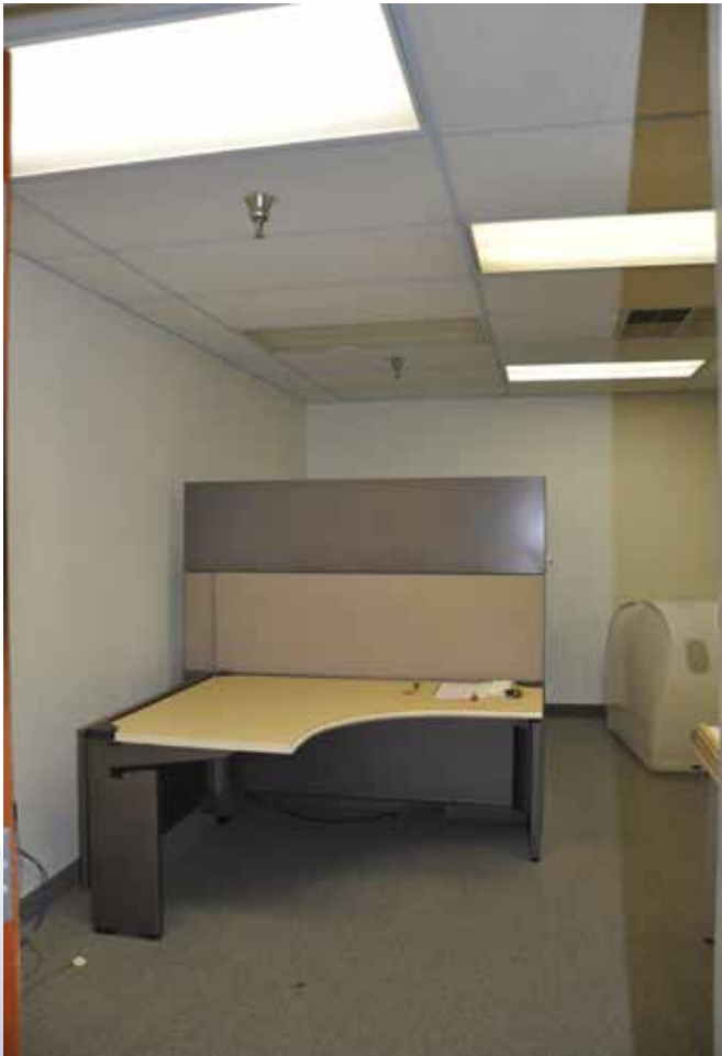
2nd Floor Office Area