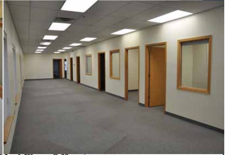
2nd Floor Office Area