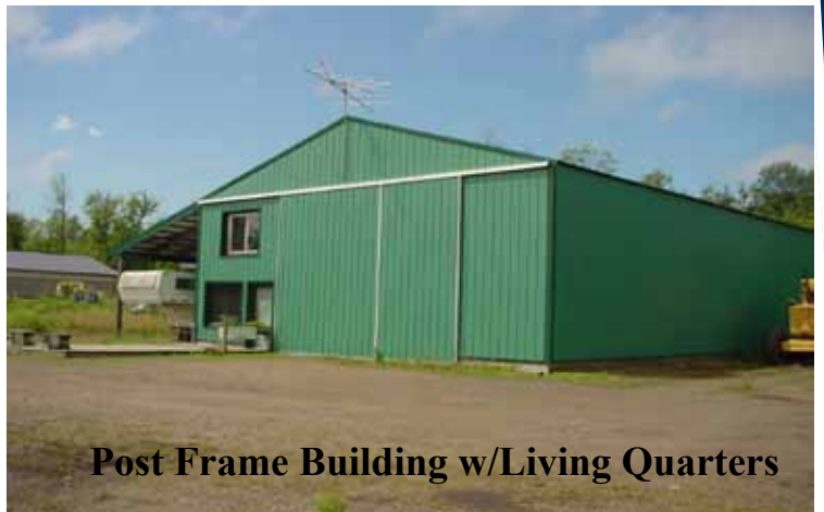
Post Frame Building w/Living Quarters