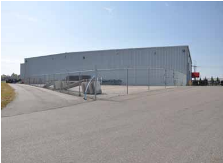
Exterior Rear of Building