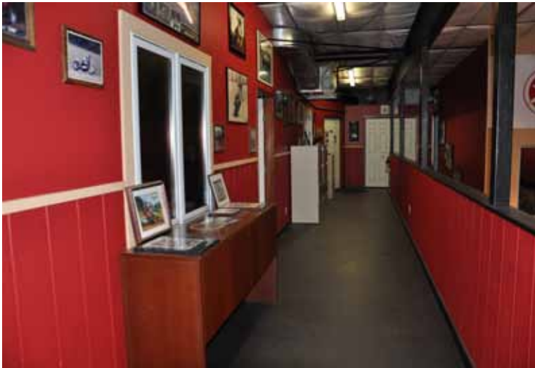
Upstairs Office Area